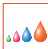
Piezo Variable Drop