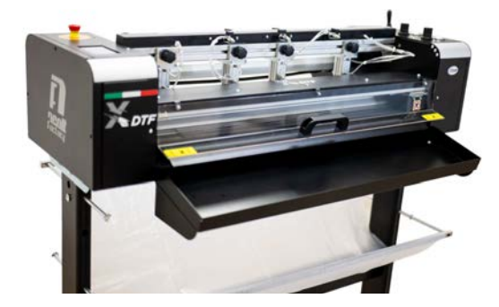
Copy collection tray