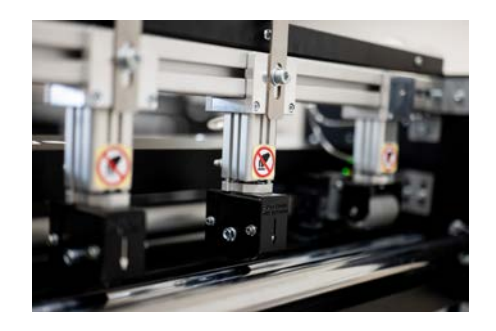
Pneumatic vertical blade