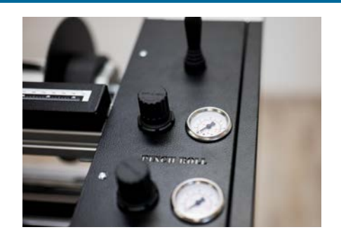
Adjustable pression for pinch roll and vertical blade