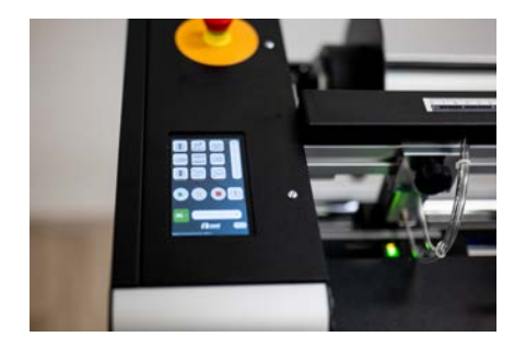
Touch screen control